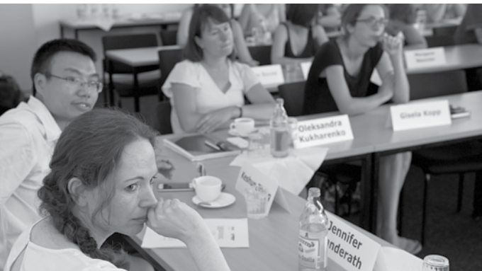
Fellows at the Jour fixe

The University of Konstanz has been successful in the German Excellence Initiative and Excellence Strategy since 2007. The Zukunftskolleg is a keystone in the University of Konstanz's institutional policy to promote top-level research and is funded by the German federal and state governments' Excellence Strategy.