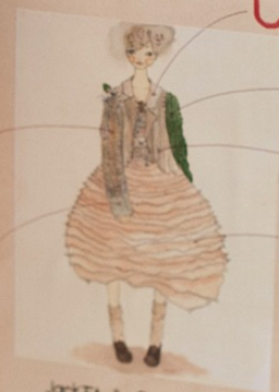
Jacket & Skirt